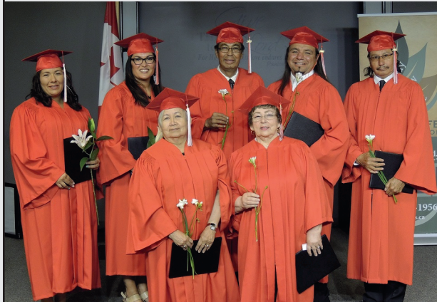
Training Ministry Leaders For The North!

Celebrating our 4th Graduating Class of Faith Life Bible School! New Session begins October 2016!